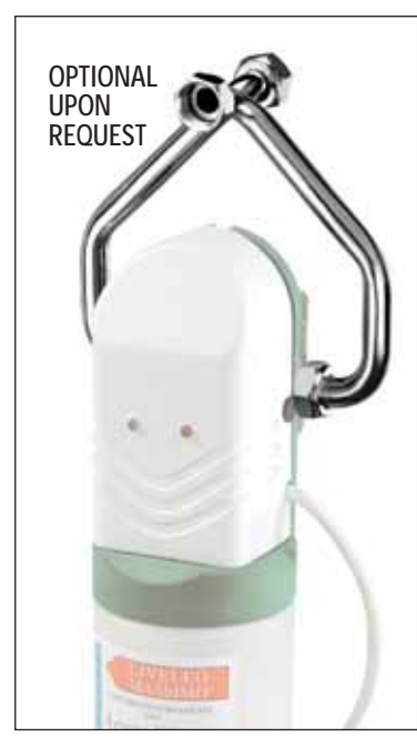
ADAPTOR KIT for metal pipes